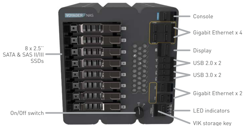
Figure 1 VoyagerNAS . Note front panel ports may vary.