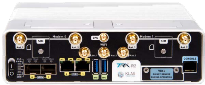
TRX R2 Front Panel (8-Core)